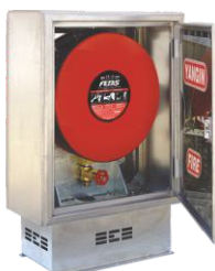
DLM.208 model FRONT VIEW