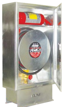
DLM.208-E model FRONT VIEW