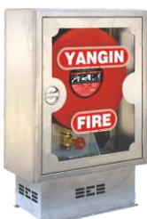
DLM.208 model BACK VIEW