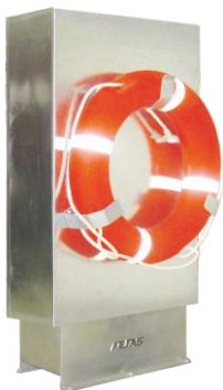
DLM.208-E model BACK VIEW